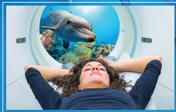
MRI In - Bore Movie Experince

1 million color range The software runs algorithm which real-time analyze the video on the screen, find main RGB color code and stream it to the LED RGB light.