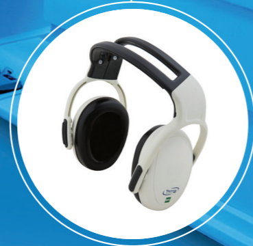
In - bore MRI Sound System